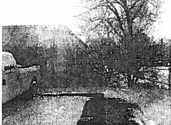
LEFT SIDE 1/29/13